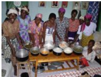
New Sunny Solutions trainers with their solar-cooked dishes