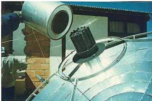
Aluminum bars are heated in a Fresnel-type parabolic cooker...