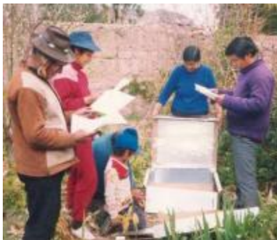
Peruvian agriculturists and herders eagerly assemble a solar box cooker

Too poor to buy kerosene to cook their meals, people living in the virtually treeless regions of the high Andes search for dead wood and branches to supplement the dried llama and alpaca dung they use to make cooking fires. The villagers of highland Peru were thrilled to see how easy it is to cook with the sun. It seemed miraculous to them and yet so simple that they wondered why they never thought themselves of using the sun's energy in this way.