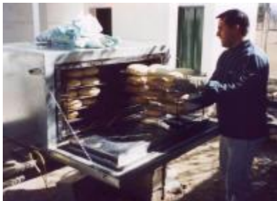
... and used as the heat source for baking bread in a large metal “oven”