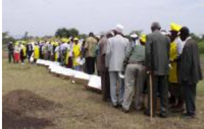
Guests and officials line up to view cookers and ask questions

By early afternoon many guests had started to arrive on foot. While the weather was very warm, the low clouds were still not interested in moving on. As guests and officials arrived they were shown a number of solar cookers, including many CookKits, a couple of solar box cookers, and a parabolic cooker. Much interest was generated. As trainers lined up to receive guests and explain how solar cookers work, the sun decided to shine!