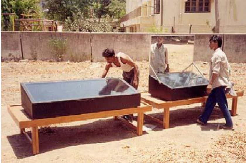
The café cookers prior to installation