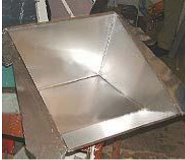
Finished inner box structure

Contact: Werkgroep Solar Cookers, p/a Kringloop winkel Sliedrecht, Rivierdijk 721, 3361 BT Sliedrecht, the Netherlands. Tel: 0031-(0)184-421189, fax: 0031-(0)184-417764; Jacob de Bruin, Kromme stoep 13, 3361 CH Sliedrecht, the Netherlands. Tel: 0031-(0)184-412545.